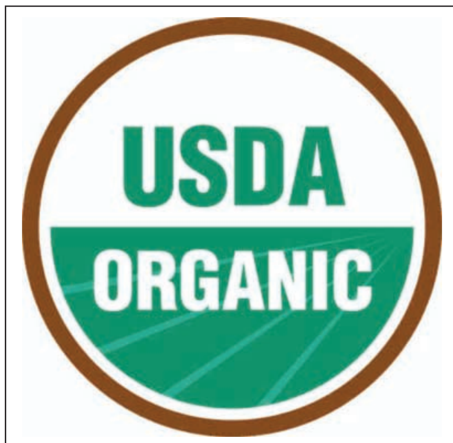
Figure 3—The USDA organic seal